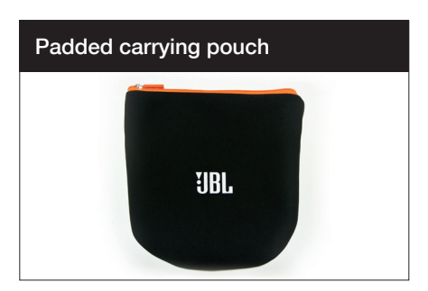
JBL sound is always worth protecting. The JBL J55 headphones come with a padded carrying pouch that keeps them safe from bumps and bruises when you're not wearing them