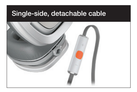
The JBL J55 headphones use a tangleresistant, flat-elastomer cable that connects to just one ear cup, which further minimizes tangling. The cable detaches from the ear cup for added flexibility.

Sometimes you need to be aware of more than just your music. The JBL J55 earphone ear cups can rotate up to 180 degrees while you're wearing them so you can keep one ear on your audio and one ear on external sounds or conversations. The ear cups can rotate under the headband for storage and transport.