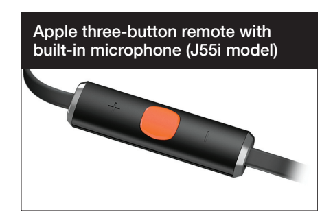
Made specifically to use with the iPhone and iPod, the in-line remote offers familiar audio-playback controls, and a built-in microphone lets you answer calls with remarkable clarity while leaving the headphones on.

A strong, secure connection between the housing and cable is critical for both durability and sound quality. The JBL J55 headphones feature a rugged strain-relief connector that dampens vibration for enhanced acoustic performance.