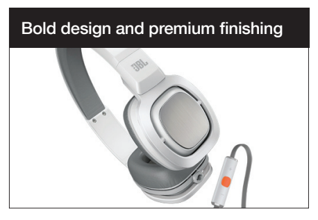
From the sandblasted stainless-steel headband and ear-cup accents to the matte-black or -white housings, and from the embossed JBL logo to the cable that matches the ear pads, the JBL J55 headphones are designed to be as pleasing to the eyes as they are to the ears.