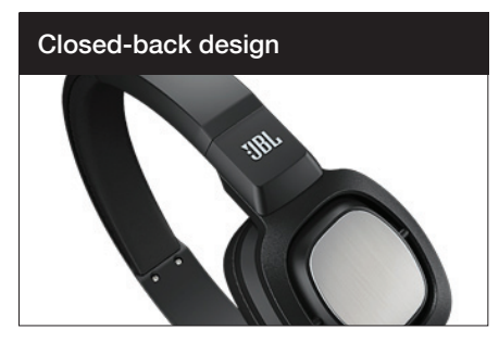
The JBL J55 on-ear headphones feature a closed-back design that blocks ambient noise and minimizes leaking. So outside noise stays outside, and your listening experience stays yours and yours alone.