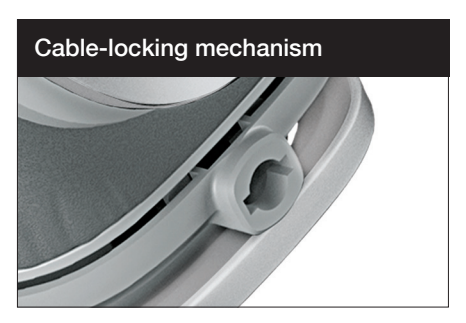
To keep the detachable cable secure when it's connected, the JBL J55 headphones employ a unique, twist-lock mechanism. When you plug the cable into the ear cup, a simple twist locks it in place.