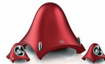
JBL Creature® II Plug-and-play nicer. Much nicer.