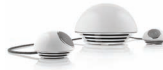
JBL Spot™ 2.1-Channel sound, available in a range of colors and patterns.