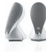
JBL Duet™ True JBL sound. Just two speakers.

>> Over the last few years, JBL has become a major manufacturer of award-winning loudspeaker systems for computers, the iPod® and other multimedia devices. Check out these and other innovative JBL systems at jbl.com or a retailer near you. They're small. They're cool. And they're pure JBL.