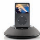
JBL On Stage™ Micro Macro performance, AC or battery power.