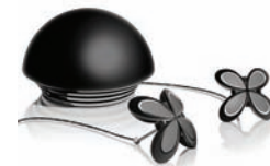
JBL Spyro™ Multimedia sound gets personal.