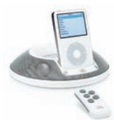
JBL On Stage™ II The iPod dock that knows how to party.