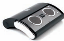
JBL On Tour® Great sound, wherever your travels take you.