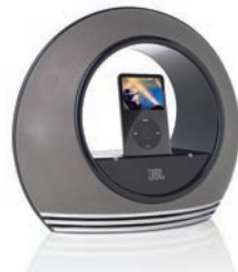
JBL Radial™ Surround your iPod with legendary JBL sound.