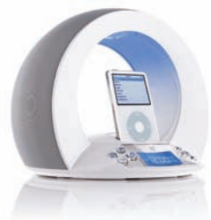
JBL On Time™ The clock radio that's playing your song.