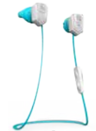
LEAP WIRELESS FOR WOMEN

IPX5 WATER RESISTANT Designed as Outdoor Equipment