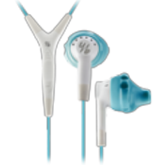
INSPIRE 400 FOR WOMEN